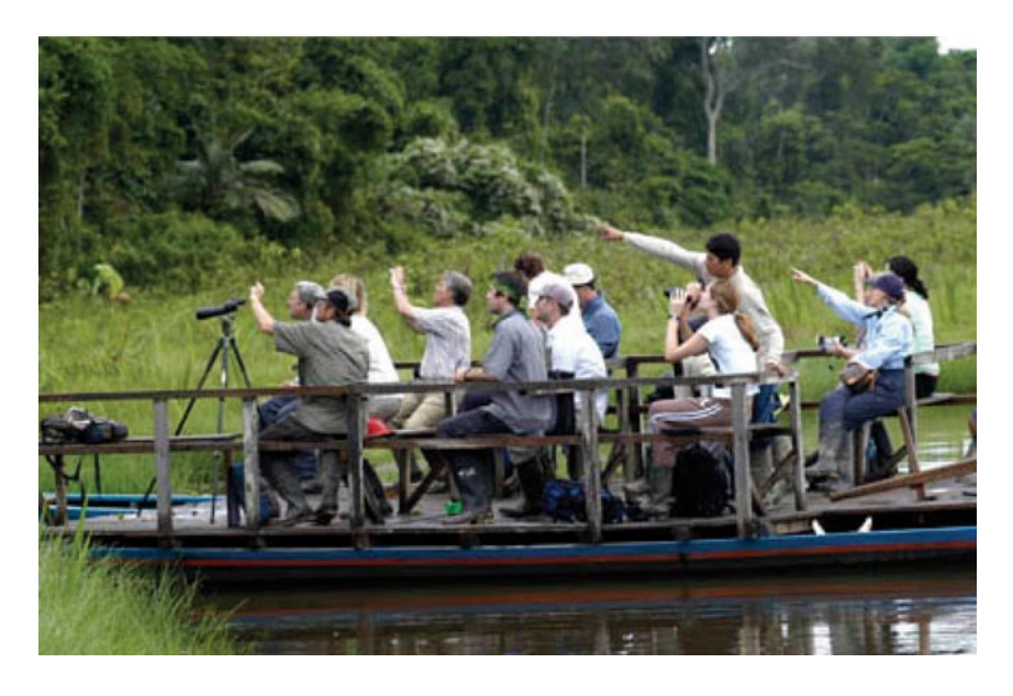
Figure 3: Oxbow lakes and the resident wildlife, including giant otters, are common pool resources managed for ecotourism.

Infierno's oxbow lakes and portion of the Tambopata River are important shared resources, especially as they represent critical habitat for a variety of local needs (alluvial soils for agriculture, fishing, transportation of goods and people, washing and bathing) and also vital habitat for countless plant and animal species people use for subsistence and commercial exploitation, and, importantly for this study, ecotourism. Of particular value for ecotourism are the highly endangered giant otters ( Pteronura brasiliensis ), as well as caimans and wading birds (Figure 3).