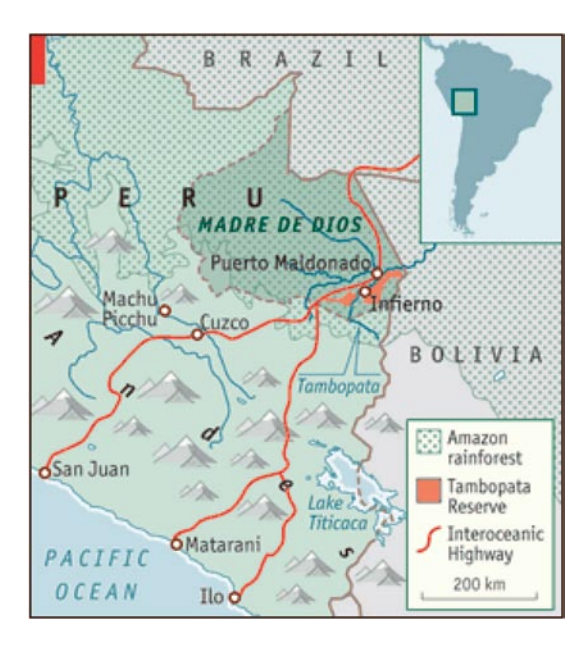
Figure 2: The community of Infierno lies between the Interoceanic Highway and the protected areas of Madre de Dios, Peru.

Recent plans to pave the road as part of the Inter-Oceanic Highway will connect Infierno and this remote region of the Amazon with major coastal markets in Peru and Brazil. Similar road construction plans exist to connect cities to the western Amazon in Bolivia, a change that will have significant ecological-social ramifications in the coming decades. Conservationists expect accelerated deforestation associated with commercial exploitation such as logging, gold mining, expansion of ranching, coca cultivation, and wildlife trafficking (Alvarez and Naughton-Treves 2003; Naughton-Treves 2004). People will also be affected, as indigenous and long-established communities like Infierno are already facing challenges as new settlers claiming their territories (Coomes and Barham 1997; Takasaki et al. 2001). In some areas these processes are just beginning, and there is still time mitigate the effects. Many conservationists are advocating ecotourism to enhance local livelihoods, secure local control over land and resources, and protect forests near the highway. Infierno is a focal point of such advocacy and attention, in particular because it has a community-based ecotourism operation